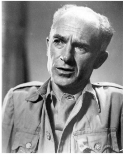
Ernest Taylor Pyle 1900 - 1945

Ernie Pyle was the most famous and beloved correspondent during World War II. His articles from the war's front brought home to people in the United States the personal stories of the brave men who served in that war.