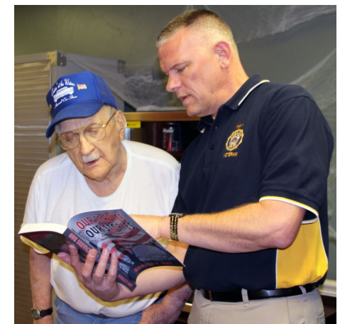
A Veteran Views His Story.

Don't let the legacy of your military service die when you do. Review it! Preserve it! And PASS IT ON to future generations so that they can be inspired by the legacy of your service!