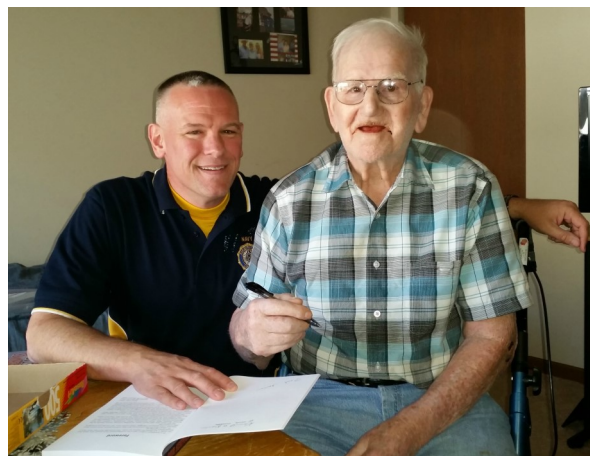
A Veteran Proudly Signs His Printed Story.